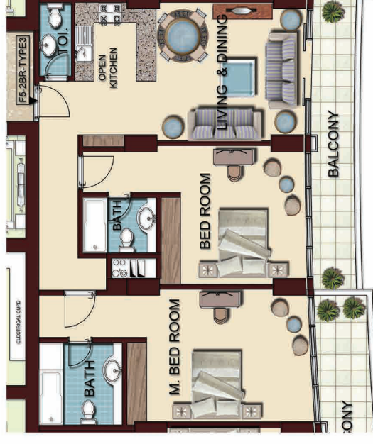
FALT NO. 5 - 2BR - FLAT (TYPE 3) FLAT AREA = 106.74 Sqmt. (1150.00 Sq.ft) BALCONY AREA = 13.24 Sqmt. (142.46 Sq.ft) TOTAL AREA = 119.98 Sqmt. (1292.46 Sqft.)