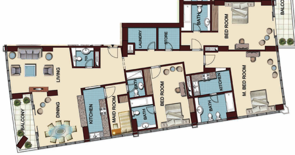
FALT NO. 4 - 3BR - FLAT (TYPE 2) FLAT AREA = 241.00 Sqmt. (2595.00 Sq.ft) BALCONY AREA = 24.65 Sqmt. (265.23 Sq.ft) TOTAL AREA = 265.65 Sqmt. (2860.23 Sqft.)